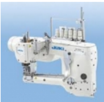
JUKI MF-3620 Flatseamer Industrial Sewing Machines, 4 Needles Call for Pricing

Two Needle Feed Off The Arm Double Chainstitch Sewing Machine [Product Details...]