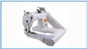
Jack JK-T9270 Two Needle Feed-Off-The-Arm Chain-Stitch Sewing Machine $2,695.00

CONSEW 3421UX-1 Tape Edge Chainstitch Machine: High Speed, Heavy Duty, Single Needle, Two Thread, Drop Feed, Needle Feed, Alternating Presser Feet, Double Chainstitch Industrial Sewing Machine (Same as SINGER 300UX5) [Product Details...]