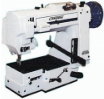
CONSEW 3421UX-1 Tape Edge Mattress Sewing Machine $6,050.00

CONSEW 3321-194 High Speed, Heavy Duty, Single Needle, Two Thread, Drop Feed, Needle Feed, Alternating Presser Feet, Double Chainstitch Industrial Sewing Machine (Same as SINGER 300U194A) [Product Details...]